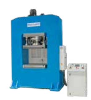
RM-500 E with CNC and hydraulic ejector