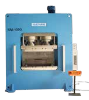
RM-1000 E. Cold stamping hydraulic press