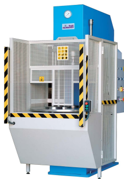
CM-100 E Indexed splitter plate with two stations