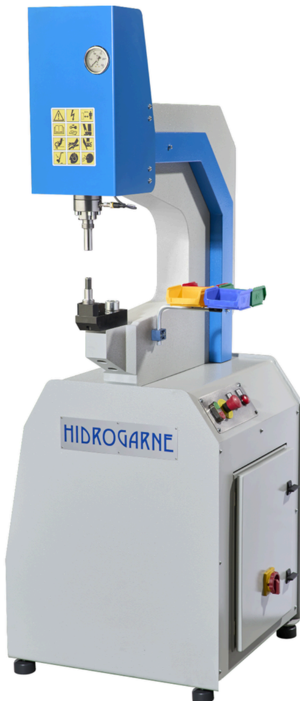
Model 60 – Standard analog version, 6-ton capacity

They incorporate a dual integrated safety system, operation by means of a dual electric safety pedal, manual pressure regulation, and return stroke adjustment of the punch, allowing fast and efficient setup of the insertion process.