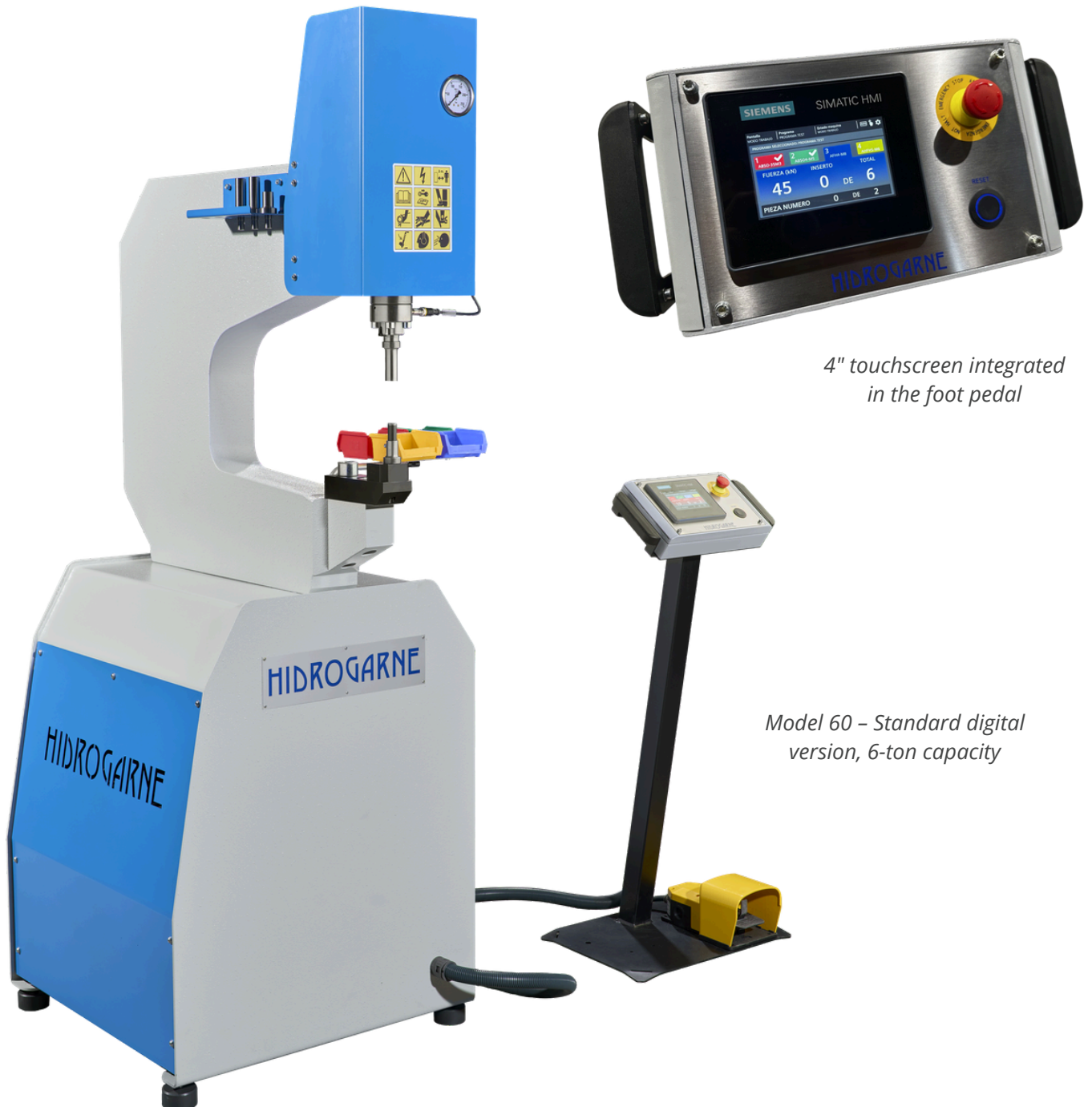
4" touchscreen integrated in the foot pedal

They are equipped with a dual integrated safety system with a distance sensor on the punch holder and operation by means of a dual electric safety pedal.